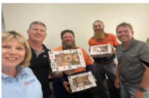
Donut King award winners— Congratulations Kingaroy Office