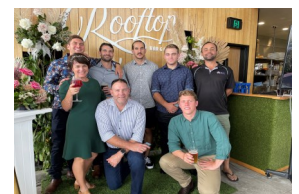
(Pic: Sunshine Coast race day)