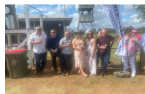
(Pic: Kumbia race day)

Thanks ONF team for a great Melbourne Cup afternoon. Always great to stop and enjoy the company of work colleagues and staff. What a great team!